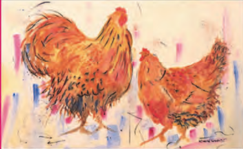
Lord and Lady Cluckingham

All paintings have a characteristic name, commissions taken, for certain sizes and colours. Range of quality UK-made tableware online